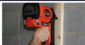
Furring attachment—perfect fastening every time in soft and hard base materials