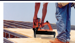
Plywood attachment—using TrakFast plywood to steel pin