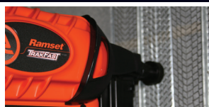
Lath attachment—using one-inch TrakFast discs and magnetic probe adapter