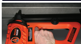
Track to steel